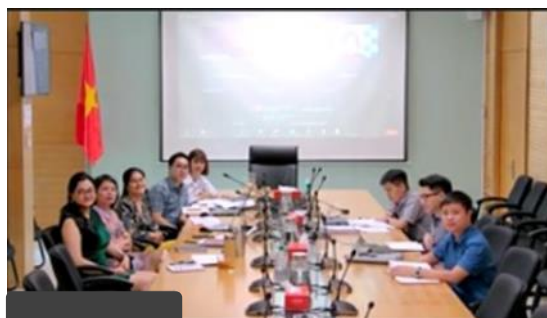
Group photo of participants the symposium participants